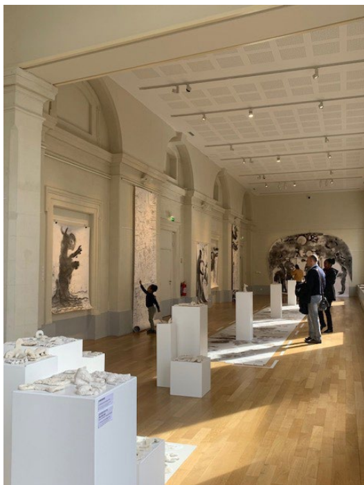
Molière Gallery during the exhibition ARTCHEVAL des écoliers