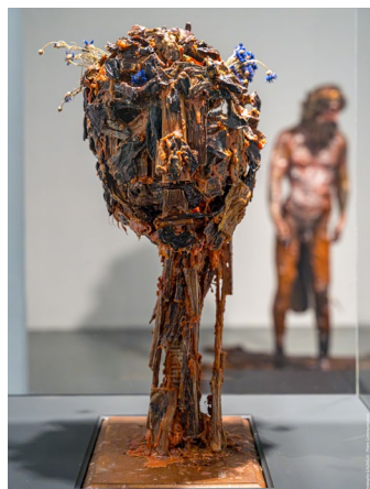
Sylvain Wavrant Exhibition « Hippoteratos » Residency ARTCHEVAL 2023