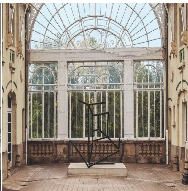
Bouvet Ladubay Contemporary Art Center Entrance