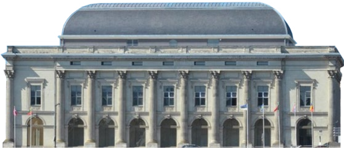
The Dôme Theatre of Saumur

The building houses an Italian-style auditorium with 423 seats, the Saumur Val de Loire Music School, two exhibition galleries, a foyer, a conference and rehearsal room, an audition room, dressing rooms, administrative offices, and a panoramic terrace.