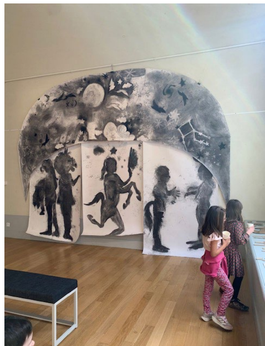
Molière Gallery during the exhibition ARTCHEVAL des écoliers