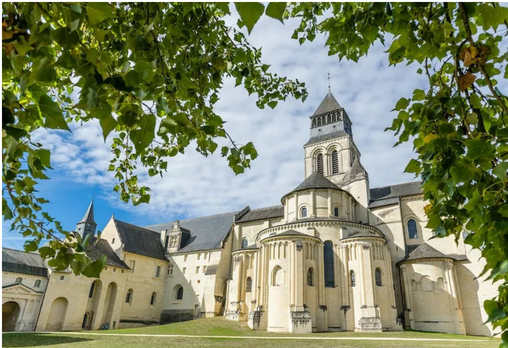
Royal Abbey of Fontevraud

Website of the Royal Abbey of Fontevraud: www.fontevraud.fr