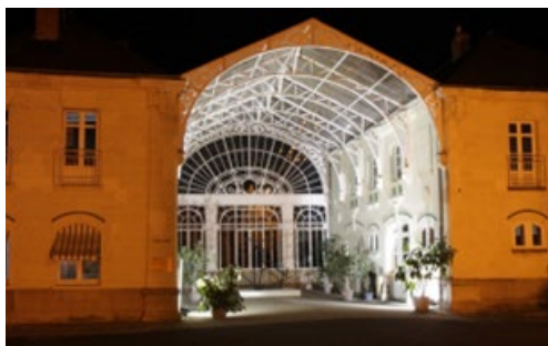
Entrance / Courtyard of the Bouvet Ladubay Contemporary Art Center – 19th-century Glass Roof

Bouvet Ladubay's website : https://www.bouvetladubay.com/en/home/