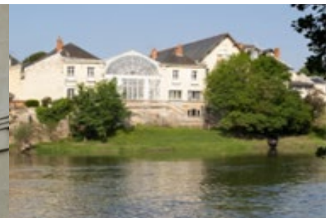
View of the Thouet River from the Bouvet Ladubay Contemporary Art Center