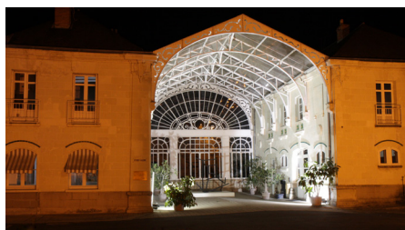
Entrance of the Contemporary Art Center Bouvet Ladubay - 19th century glass roof

Many artists have exhibited in the Bouvet Ladubay Contemporary Art Center : Discover the artists