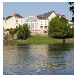
View of the river Le Thouet from the Contemporary Art Center Bouvet Ladubay, this river flows into the Loire 1km away.