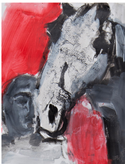
Hélène Milakis Échappé(es) ARTCHEVAL 2021