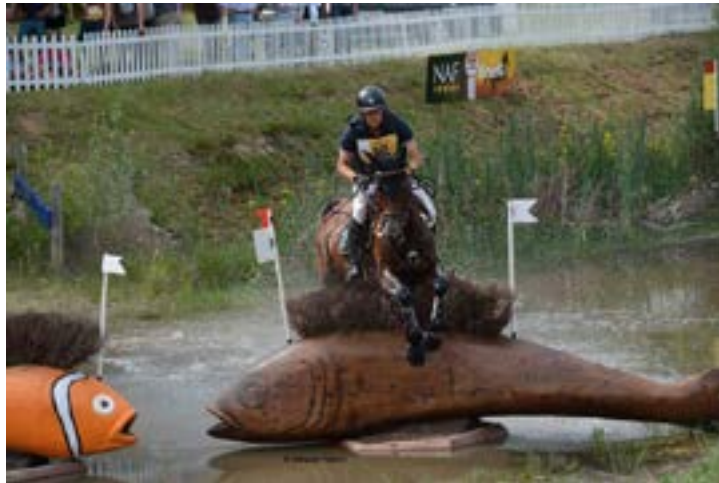
NAF OFFICIAL PARTNER OF CCI1*