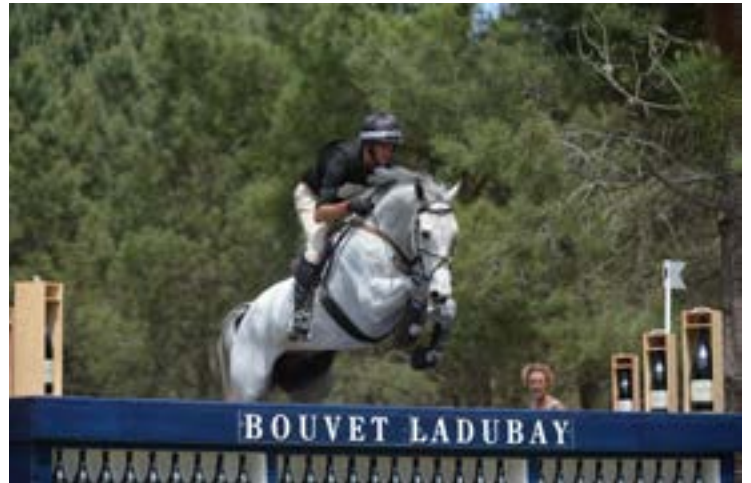
BOUVET-LADUBAY LOYAL PARTNER OF EQUESTRIAN SPORTS IN SAUMUR